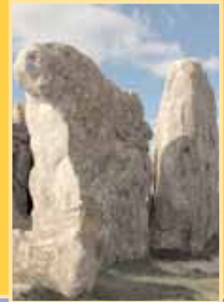
West Kennet Long Barrow

People have been creating monuments and memorials to people, places, events and gods for thousands of years. These take a wide range of forms: from the huge standing circles, barrows and cairns of prehistory, to First and Second World War memorials. Gravestones, plaques, buildings, stained glass windows, clocks, gardens and statues can also be monuments and memorials too.